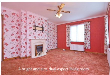
A bright and airy, dual aspect living room