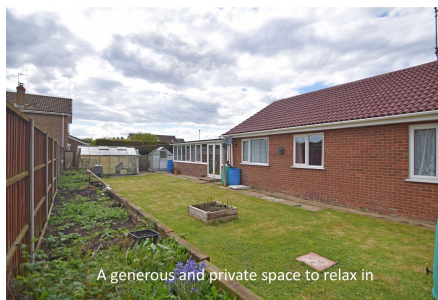
A generous and private space to relax in